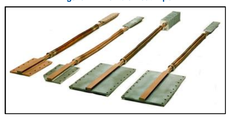
Figure 2 – Flexible Heat Pipe Cold Plate